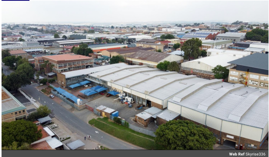
Web Ref Skyrise336