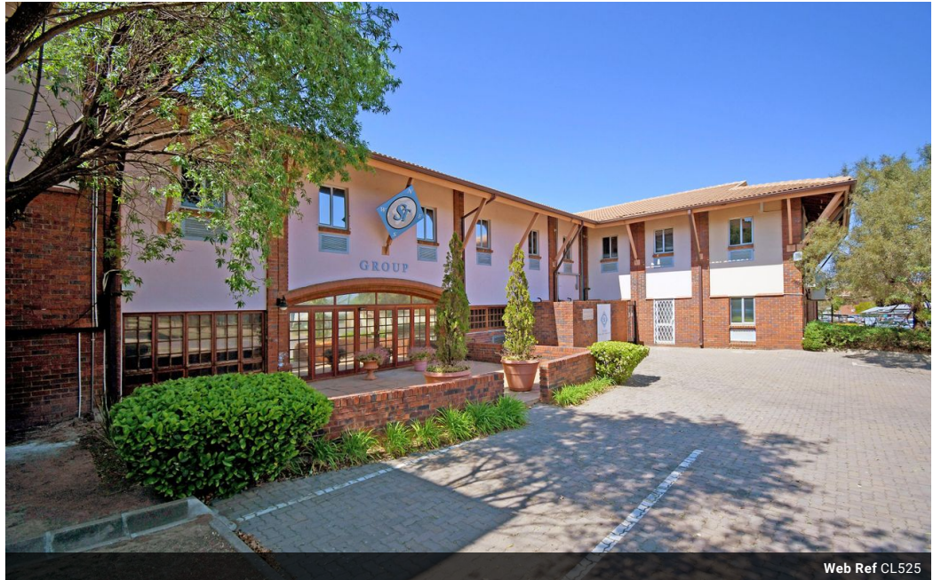
Web Ref CL525

First Floor Masingita House 41 West Street, Houghton Estate Johannesburg