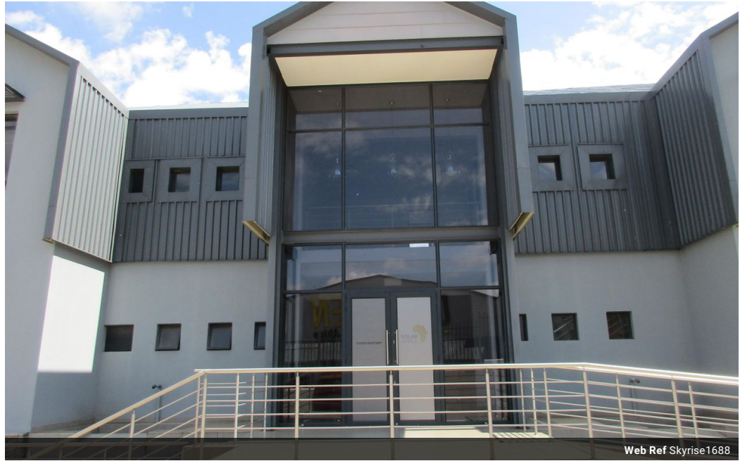
Web Ref Skyrise1688

First Floor Masingita House 41 West Street, Houghton Estate Johannesburg