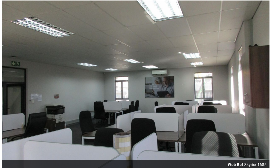
Web Ref Skyrise1685

First Floor Masingita House 41 West Street, Houghton Estate Johannesburg